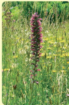
Red viper's buglass