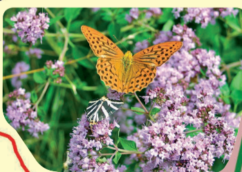
Silver washed fritillary Castle Hill of Füzér and its Surrounding Strictly Protected Area