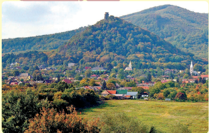
The Castle Hill of Szalánc (Slanec) from the south