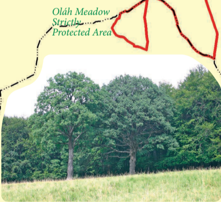
Oláh Meadow Strictly Protected Area